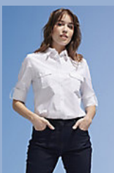
SOL'S BURMA WOMEN 02764